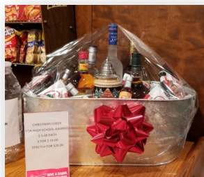
Not actual basket

The annual fundraiser for our PER Association is available in the clubroom. This funds our Student of the Month program for Lee Senior and Southern Lee. Tickets $ 5.00 each or 3 for $10.00 or a S T R E T C H for $ 20. Drawing December 15th during Manager's Treat.